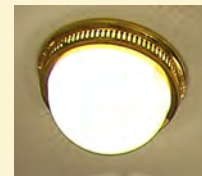
It's the one at the top left.

Chicago Merchandise Mart Urban Archeology, a high-end lighting, bath, and tile manufacturer and retailer, participated in field testing the Philips entry in one of these ceiling fixtures. Can you tell which one has the Philips samples? We can't!