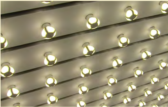
Long-term testing of the L Prize entry is being conducted in a specially designed high-temperature test bed.

In March 2011, stress testing was conducted to subject sample products to extreme conditions such as high and low temperatures, humidity, vibration, high and low voltage, and various electrical waveform distortions.